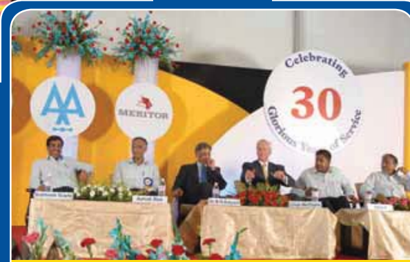
Dignitaries on dias