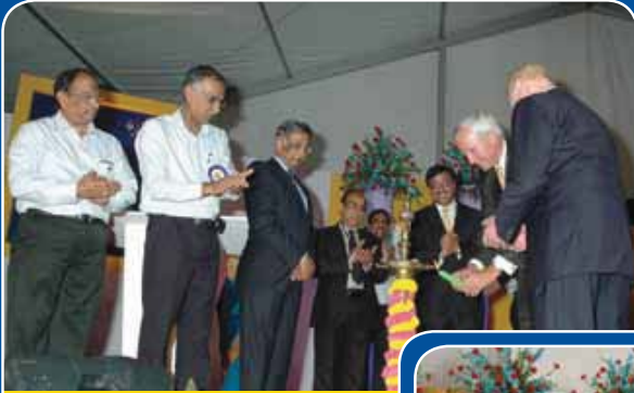
Celebration started with lighting of lamps by dignitaries