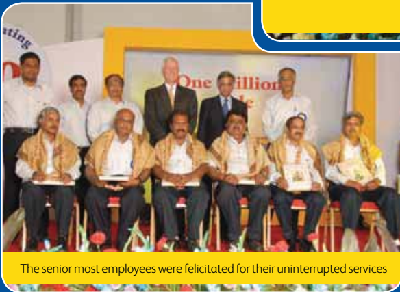
The senior most employees were felicitated for their uninterrupted services