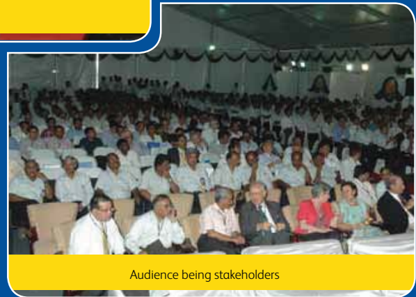
Audience being stakeholders